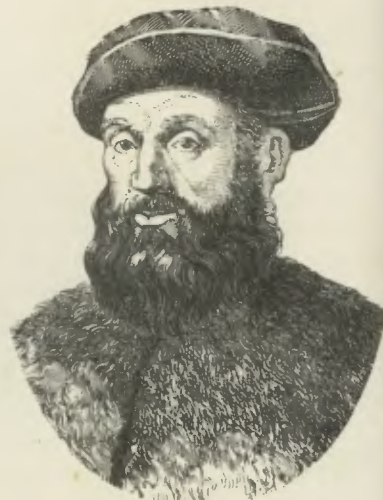
FERNAN MAGELHAENS (MAGELLAN) reached Pacific Ocean through Magellan's Strait on 28 November 1520.

THE MEN WHO OPENED THE LAND AND SEA BARRIERS BETWEEN SPAIN AND THE SPICE ISLANDS.