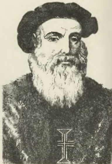
VASCO DA GAMA reached India in "San Rafael" 1498.