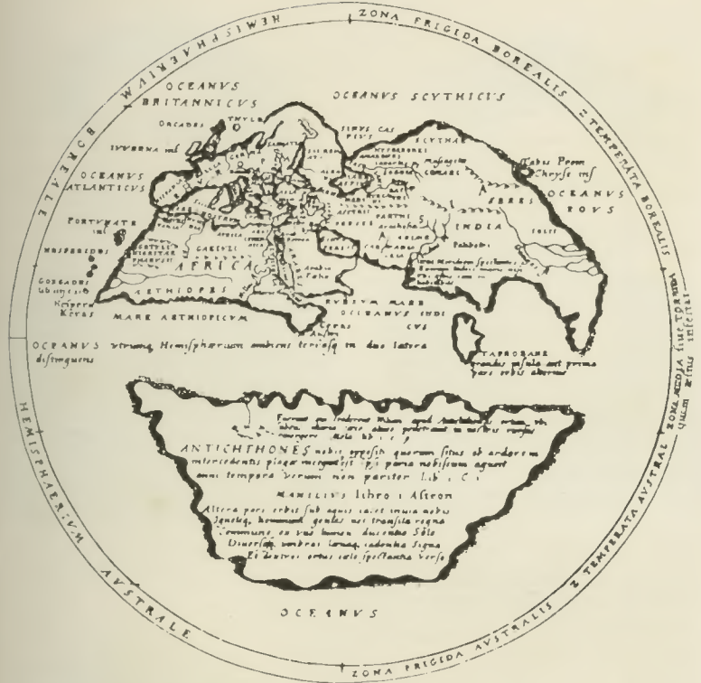
ANCIENT IDEA OF THE WORLD—a great "Southland" balancing the northern land mass with a burning zone at the Equator. Note Taprobane (Ceylon—also confused with Sumatra and Madagascar)—"either a great island or the first part of the 'other world,'" and the blank above the Caspian Sea.