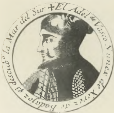
VASCO NUNEZ DE BALBOA Crossed Isthmus of Panama and discovered Pacific Ocean, 29 September 1513.