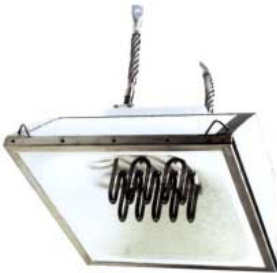
The Kanthal High Power Reflector from the new Superthal range of heating modules.

Designed for power up to 110kW/m 2 at 1650°C, the reflector provides concentrated, high and clean power, suitable for single