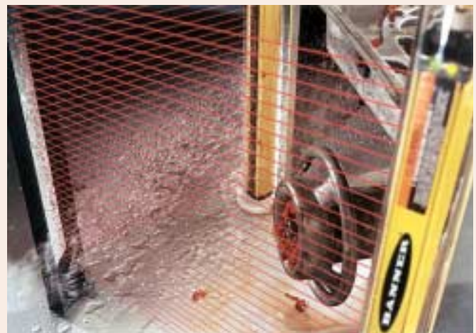
Watertight light screen enclosures and corner mirrors for food processing applications.