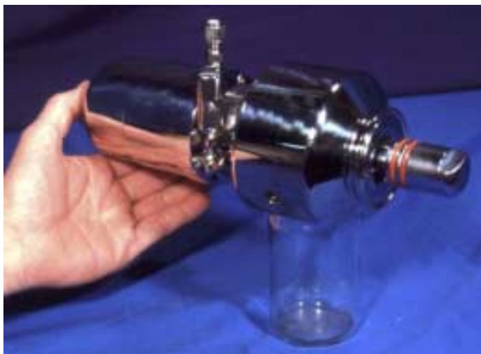
Bristol Isolok MSC sampler for medium viscosity fluids.

Bristol Equipment Company has added the new Series MSC to its Isolok family of automatic sampling devices. Designed for flowable medium-viscosity process materials, the samplers draw measured amounts of heavier fluids such as cream, condensed milk, whey or single-strength orange juice from an automatic control.