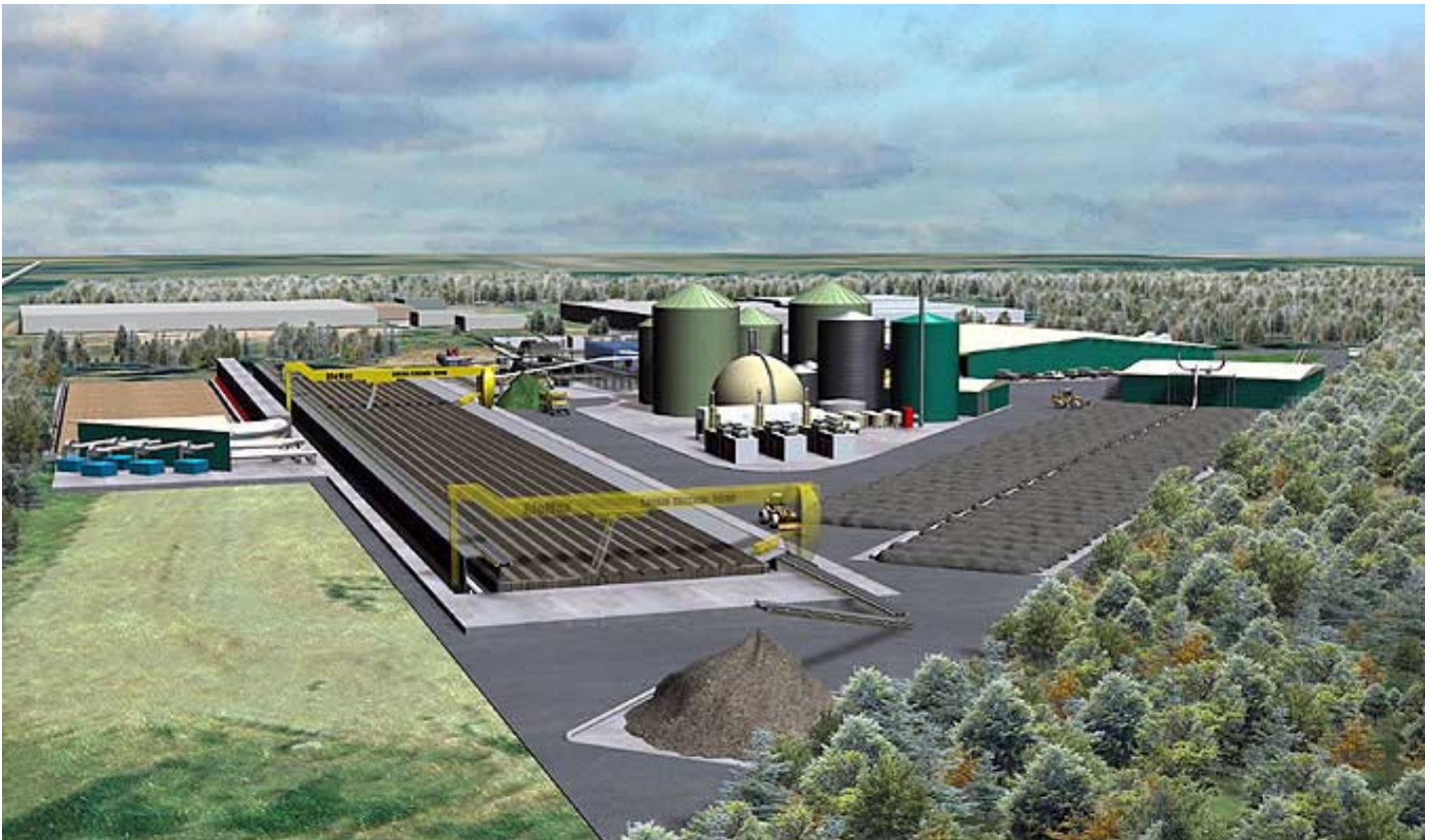
Artist's impression of the waste treatment facility to be built in Sydney.

Construction of the plant will be finished late in 2004, with production to start at 820,000t/a of pig iron in stage 1, increasing to 1.64Mt/a in stage 2 (by 2006).