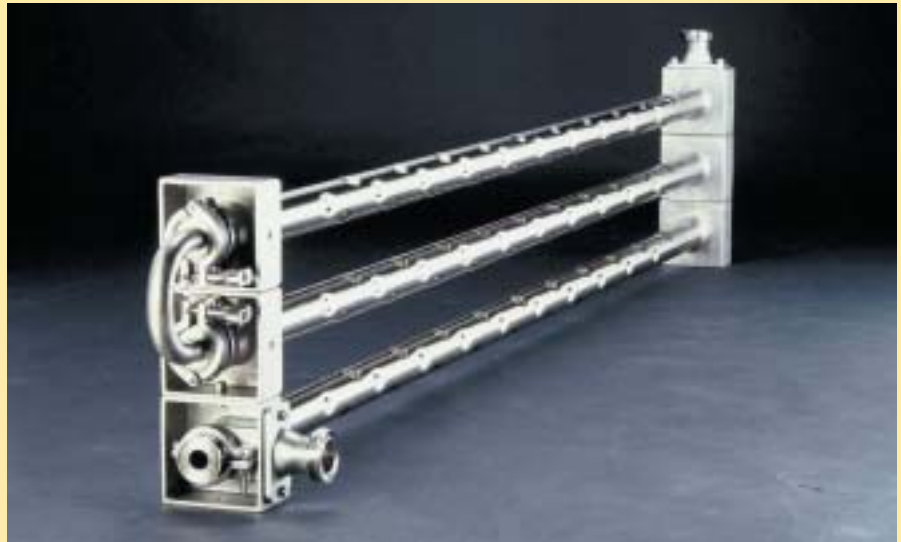
Teralba Industries' Dimpleflo heat exchangers are now available with titanium tubes.