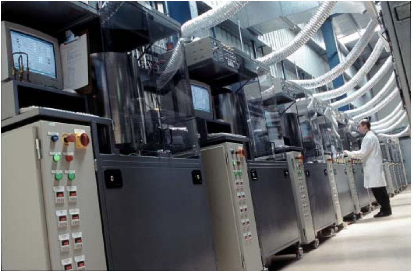
A bank of fuel cell test stations at CFCL's pilot plant in Noble Park, Victoria.