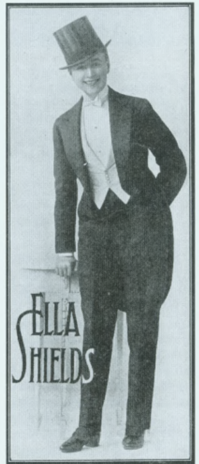
(below) Detail from sheet music for 'I'm Going Back Again to Yarrowonga', c.1919 From the Music collection