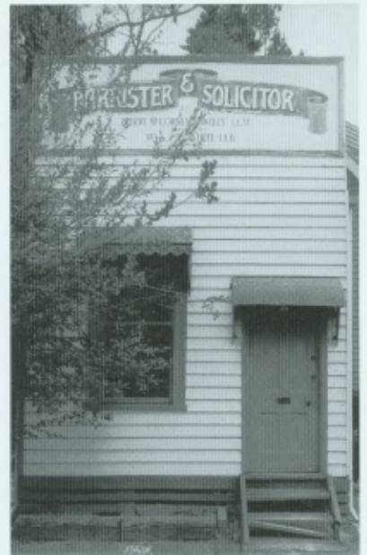
Reconstructed barrister's and solicitor's office, 'Old Gippsdown', Moe, 1995

I do not believe that Australians have lost their 'sense of place',