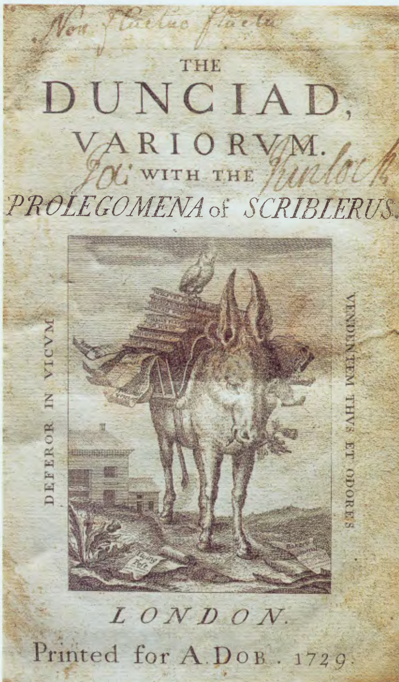
Title page of The Dunciad by Alexander Pope (2nd ed. London: Gilliver, 1729)

(opposite) One of the 'new and curious set of sixty-two maps, in which are shewn all the Empires, Kingdoms, Countries, States, in all the known parts of the Earth;... the whole composed and laid down agreeable to modern History' in Atlas Minor (or Moll's Atlas Minor) by Herman Moll (London: Thos Bowles and John Bowles, c.1732)