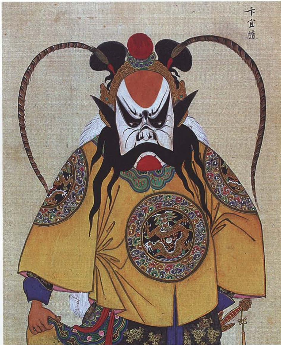
Album of Beijing Opera Characters from the Shengping Bureau, 1844 ink, colour, white pigment, gold on silk, 33.3 x 23.9 cm, Courtesy of National Library of China, Beijing

Over 150 treasures that have shaped our world