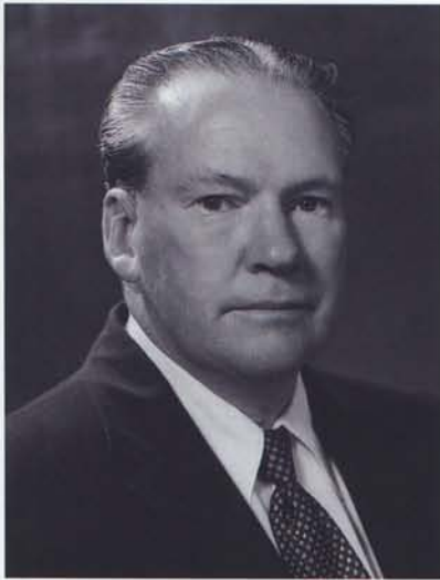
Unknown photographer Portrait of Fred Daly, Labor Member for Grayndler, House of Representatives, Parliament of Australia 1959 b & w photograph; 15.4 x 11.0 cm Pictures Collection, nla.pic-an24717001