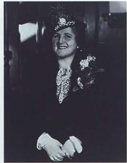
Dame Enid Lyons, the first female Member of the House of Representatives in Commonwealth Parliament