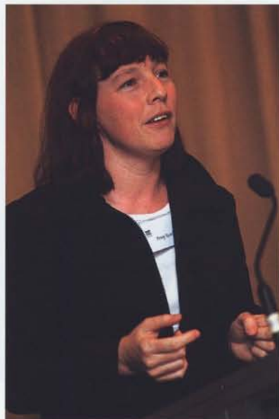
(top) Colin McPhedran Pictures Collection, NL39177