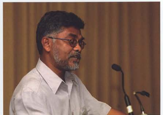
Professor Brij V. Lal Pictures Collection, NL39177