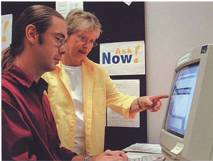
AskNow! operators in the State Library of Western Australia

Kinetica, the Australian bibliographic database—occasionally a user will ask a question that can best be answered by a particular library. This might be a local history question, or a question that can only be answered by reference to a manuscript held by a particular library. Because of the national nature of the service, there is no guarantee that a South Australian user, with a peculiarly South Australian query, connecting to AskNow! at a particular time on a particular day, will connect with a librarian from the State Library of South Australia. Indeed, the chances are high that he or she will end up chatting online to a librarian from the ACT or Queensland or elsewhere.