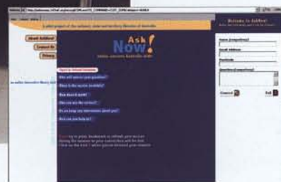
AskNow! live page

service on their own, none would have had the resources to offer the service for 50 hours a week. Together, helped by the peculiarities of Australia's time zones, they have been able to have reference librarians on call from 9 am until 7 pm AEST, Monday to Friday, for the duration of the trial.