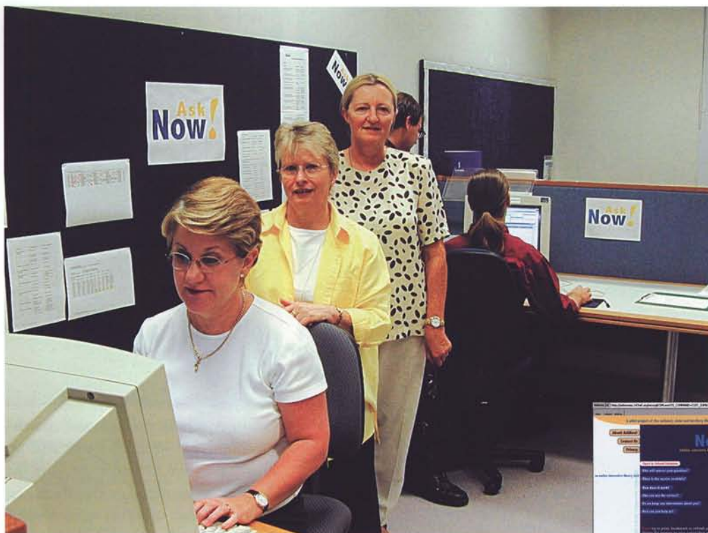
AskNow! operators in the State Library of Western Australia