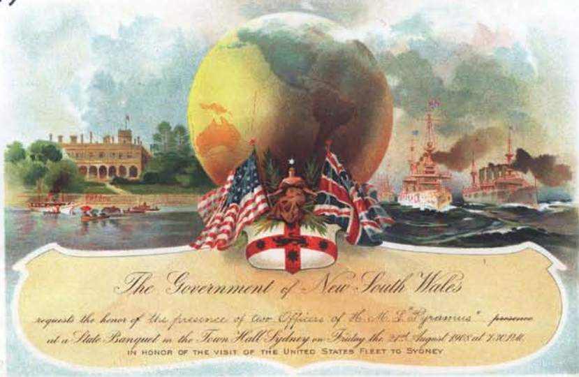
left: State Banquet in Honor of the Visit of the United States Fleet, Sydney Town Hall, August 21, 1908. Invitation. (Sydney: New South Wales Government, 1908) Ephemera Collection