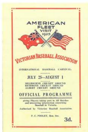
above: American Fleet Visit 1925, International Baseball Carnival, July 25–August 1, Official Programme. (Melbourne: Victorian Baseball Association, 1925) Ephemera Collection