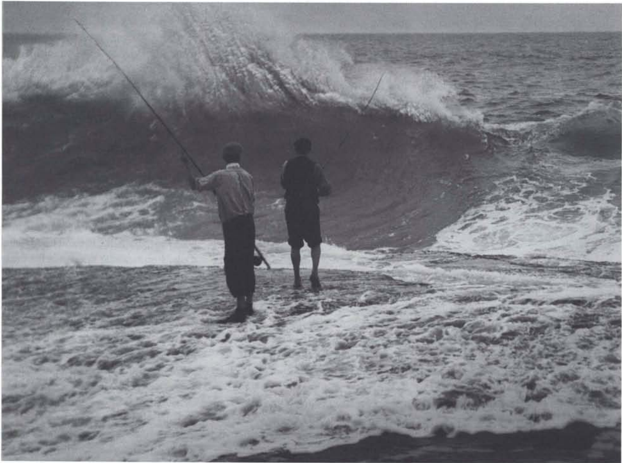
Harold Cazneaux (1878–1953) Fishing off Rocks, Bondi 1904 photograph; 17.8 x 24 cm Pictures Collection; nla.pic-an2384527

Of course, very few Australians will ever be in possession of items of such historic importance or interest. But that does not mean that every Australian cannot play a role in the development of the collections. Over the years, the Library has come up with some innovative ways of encouraging participation by ordinary Australians in the building of the collection, and often at little cost to the giver.