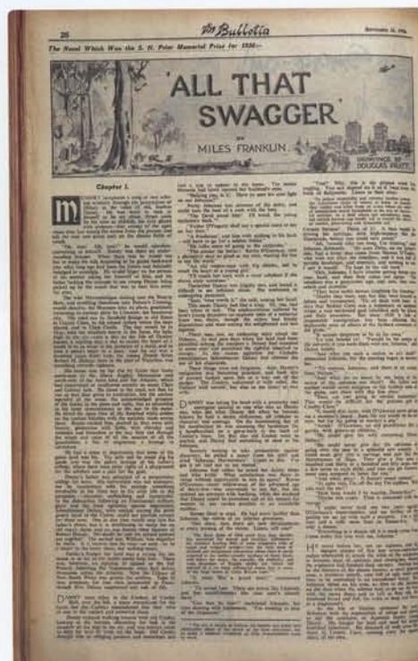
right: 'All That Swagger' by Miles Franklin. Reproduced from The Bulletin, 16 September 1936

All that Swagger won the S.H. Prior Memorial Prize in 1936, received good reviews and Franklin received hundreds of fan letters. It was broadcast on the radio and reprinted regularly. It was My Brilliant