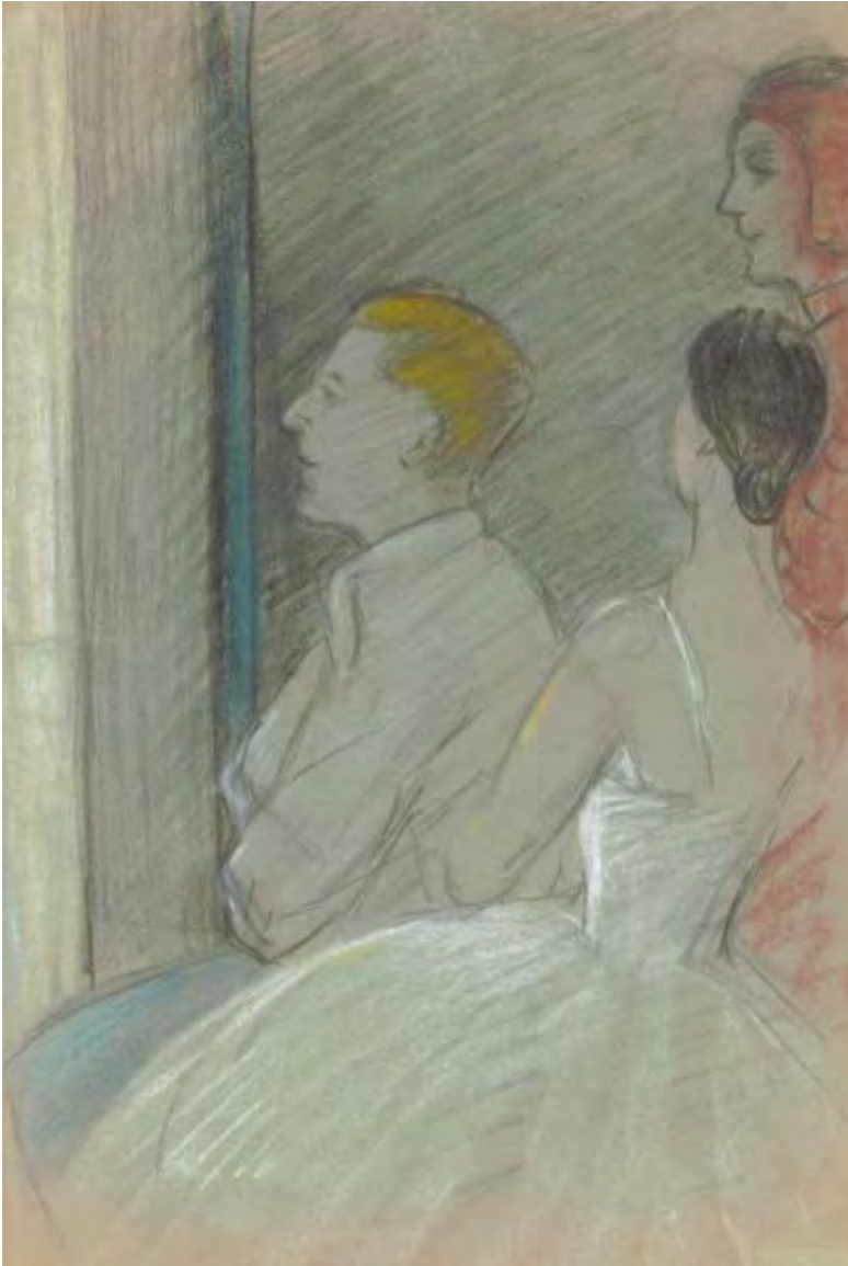
Enid T.L. Dickson (1895–1967) Fokine and Dancers in the Wings, Covent Garden Russian Ballet, 1938–1939 coloured pastel drawing on velvet paper; 35.8 x 24.2 cm Pictures Collection nla.pic-vn3671453