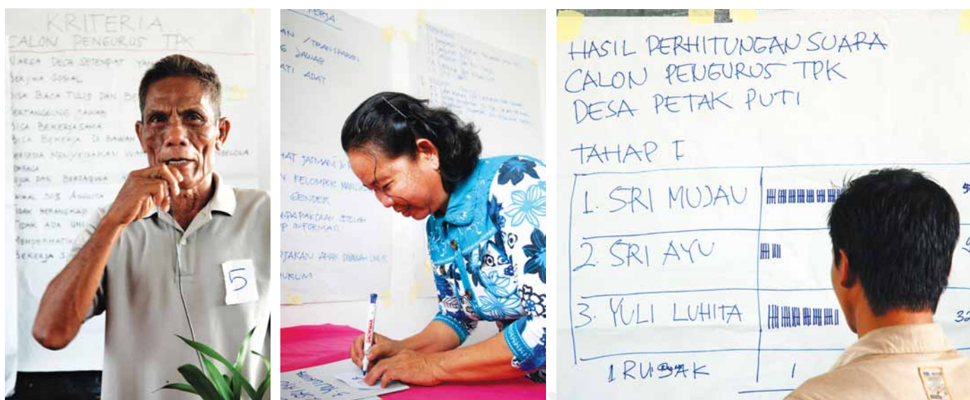
Community members of Petak Puti village participating in the TPK member election process.

This process of consultation and review has been completed in seven villages and all have signed the agreements.