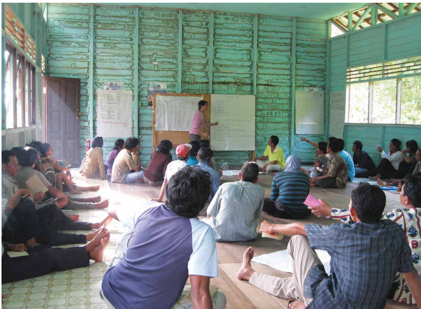
Community consultations in Sei Ahas village.

oxidation. Another example is encouraging reforestation in the degraded areas through growing seedlings and undertaking planting activities. These activities and others provide improvements to local livelihoods, such as rubber agroforestry, in ways that reduce pressures on forest and peatlands.