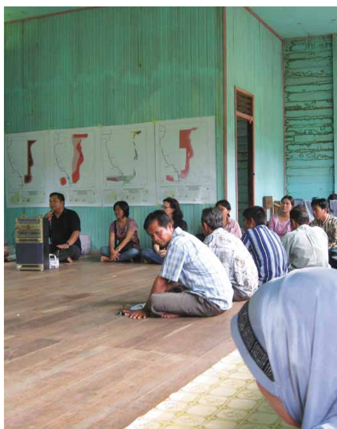
Village meeting on thematic maps development, part of the midterm village development planning in Sei Ahas village.

In order to engage local communities in REDD+ management, KFCP has entered into formal agreements with seven villages (two villages split in late 2012 to form two new villages, which are still covered by existing agreements, taking the total to nine) in the Mantangai and Timpah sub-districts of Kapuas, Central Kalimantan. The agreements allow KFCP to finance and support these communities to carry out REDD+ activities, and they outline management and governance arrangements. The Village Agreements are a first step towards establishing long lasting institutions for REDD+ and can be used to manage and fund all range of activities, from livelihoods to village forests (hutan desa).