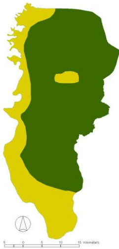
2. Kapuas District Government decree 4/2002 – RTRWK