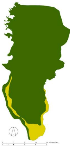
5. Ministry of Forestry Decree P.55/2007