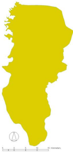
1. 759/Kpts/Um/10/1982 – TGHK