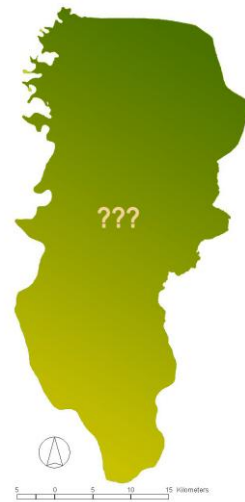
6. PP 26/2008 - RTRWN