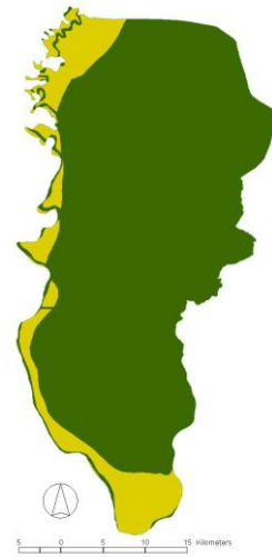
3. Central Kalimantan Local Government decree 8/2003 – RTRWP