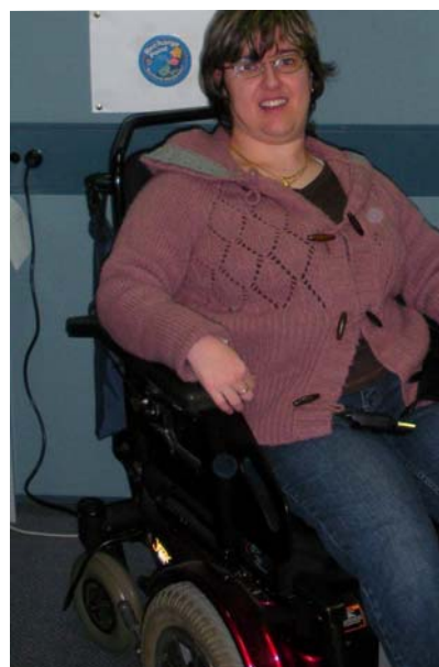
Recharging at Melton library