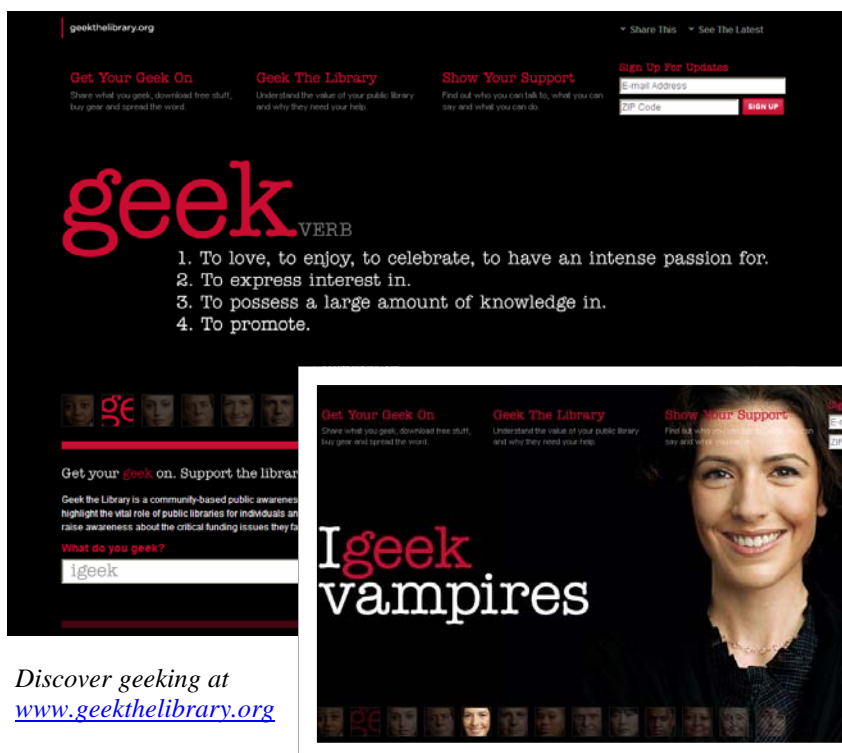
Discover geeking at www.geekthelibrary.org