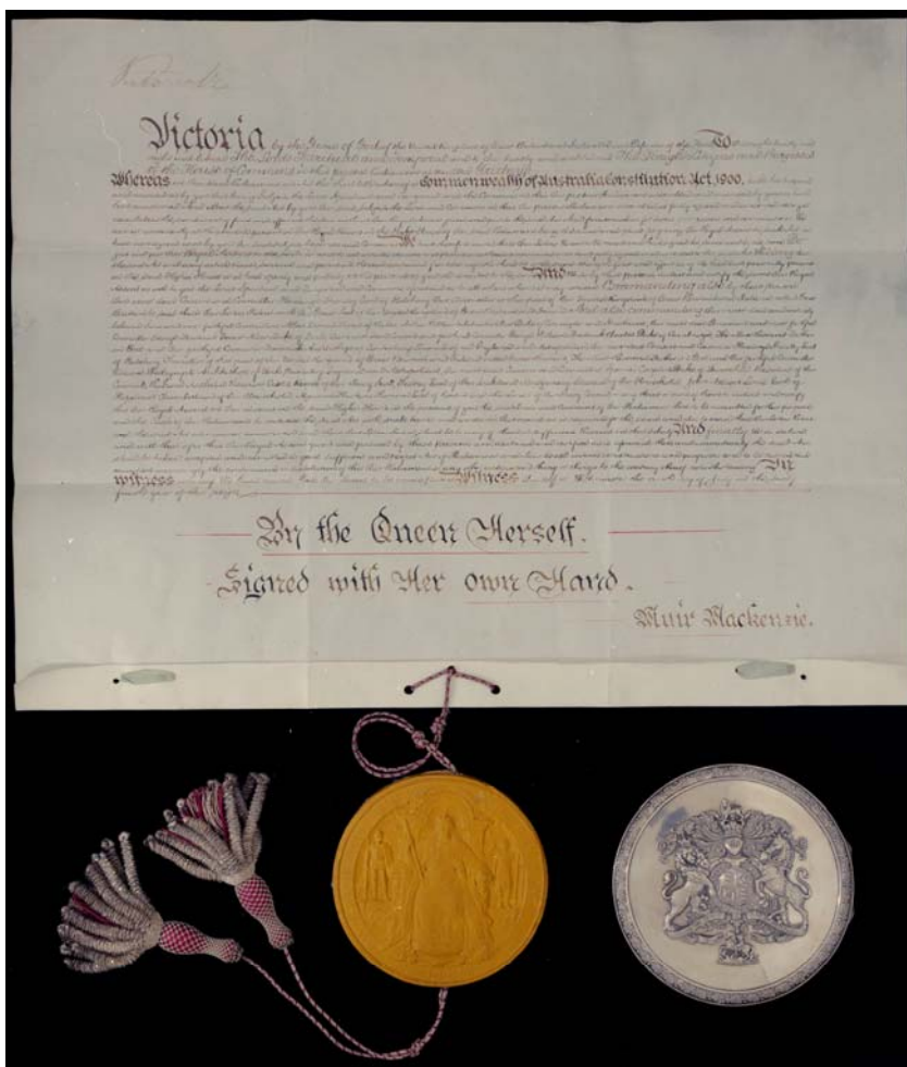
Queen Victoria's Royal Assent to the Commonwealth of Australia Constitution Act, 1900