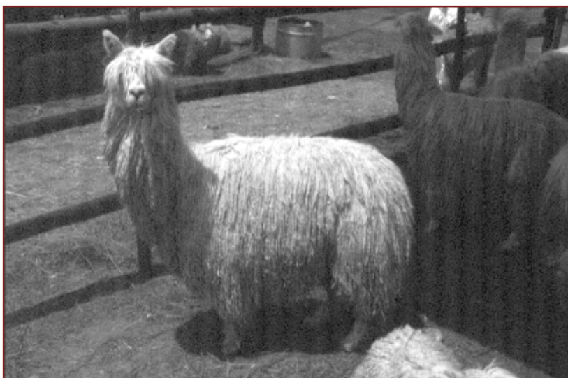
Suri type alpaca.

Although many think that alpacas and llamas need high altitudes and harsh conditions, it is far from true. Various histories (fossil, Spanish) show that the animals evolved and were managed by the Incas on good pastures at low altitudes. Their survival in the high Andes since the mid-1500s is a matter of necessity rather than evolution.