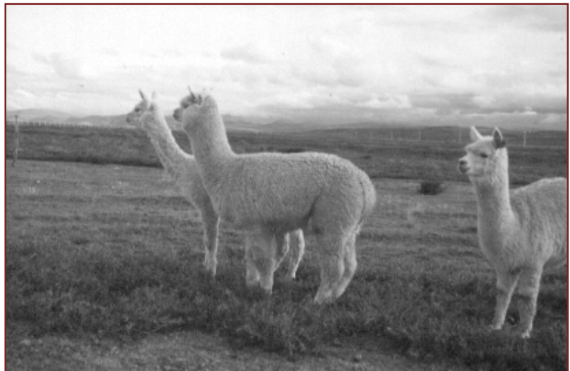
Huacaya type alpacas.

The animals are shorn annually for their fleece. The timing of shearing should relate to other considerations such as the risks from grass-seed invasion. The animals are susceptible to sunburn if they are shorn during summer and insufficient fleece is left on. Alpacas have a soft, padded foot, similar to those of camels, which are likely to cause less damage to the soil structure, and subsequently the environment, than do sheep and cattle.