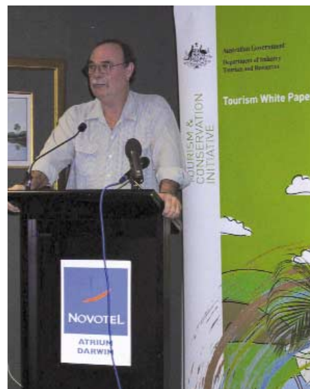
The Hon Warren Entsch MP, Parliamentary Secretary to the Minister for Industry, Tourism and Resources, launching the Tourism & Conservation Initiative

"It will help develop methods to protect our environment, while providing industry with greater certainty to develop new, and improve existing, nature-based tourist attractions."