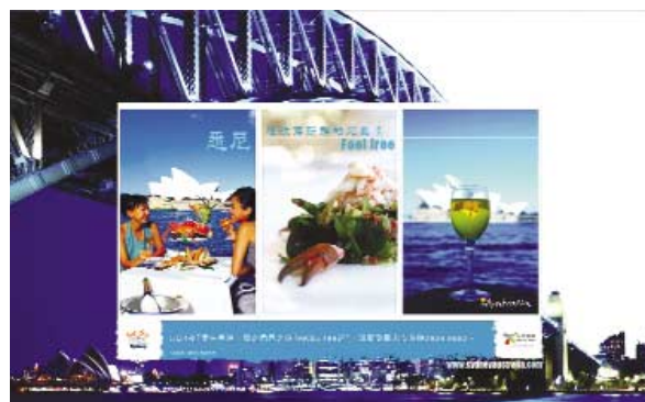
Australian Tourist Commission advertising from the latest series of campaigns.

For more information about the ATC’s marketing campaigns, visit www.atc.australia.com