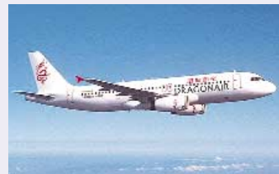
Dragonair's A320 Airbus, part of the fleet expected to begin flights into Australia in 2005

The Agreement is the latest in a series of developments in air services arrangements-including those with the United Arab Emirates, Korea and the People's Republic of China. Emirates recently announced that it will