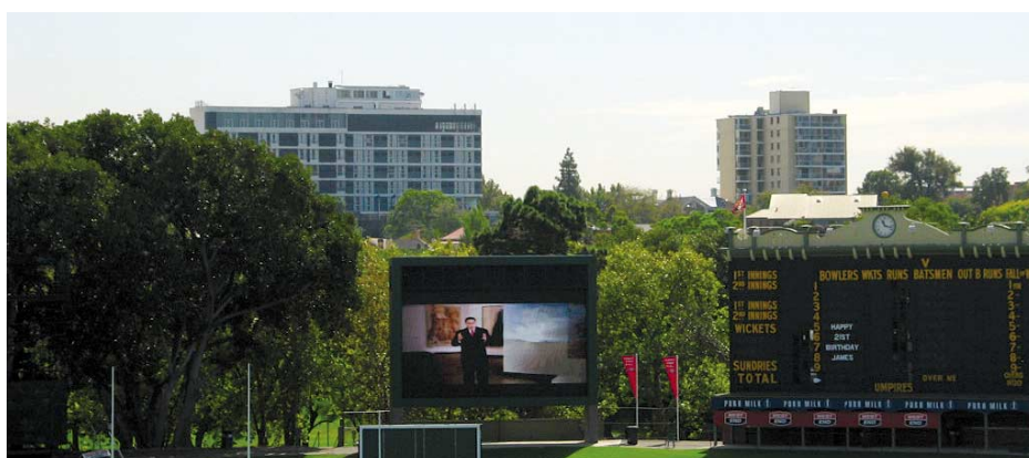
Images from the new DVD, as seen on the Adelaide Oval big screen during its premiere viewing at the launch of the Australian Tourism Development Program

The new tourism multimedia presentation, Platinum Australia, A Strategy for Tourism , provides a concise overview of the key initiatives and measures contained in the Tourism White Paper. It is suitable for all interested audiences, including industry and educational institutions.