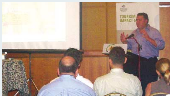
Minister Hockey demonstrates the Tourism Impact Model at the launch