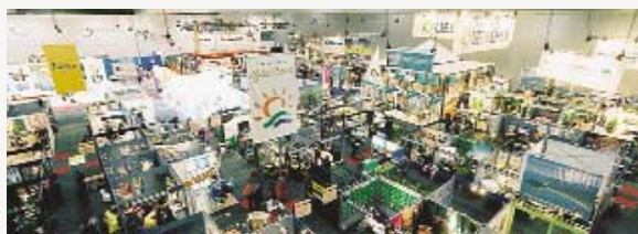
The buzz of ATE 2003—the largest tourism trade event in the Southern Hemisphere

Preparations are well underway for the Australian Tourism Exchange (ATE) 2004—the largest tourism trade event in the Southern Hemisphere and the most important event in Australia's tourism calendar.