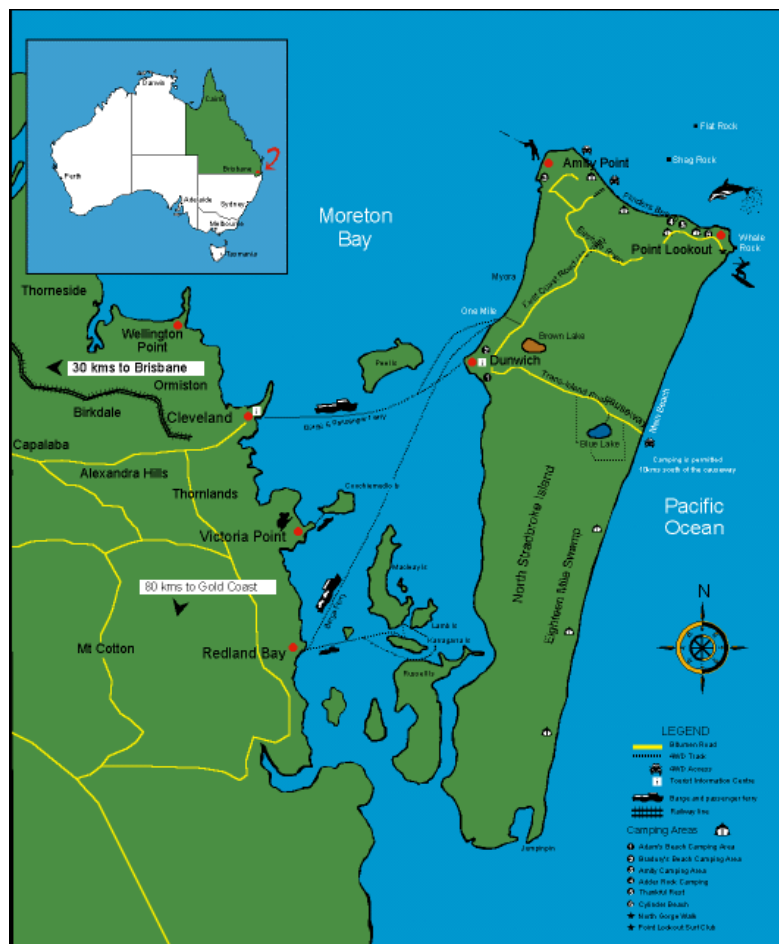
Figure 1: Redland Shire, location and major transport links

Natural resources in the region include commercially significant amounts of rutile, zircon and ilmenite. In 1998/99 the value of rutile concentrate and zircon concentrate mined in the area was $68.7 million and $27.8 million respectively. This represented 100% of the total value of Queensland's production of these minerals.