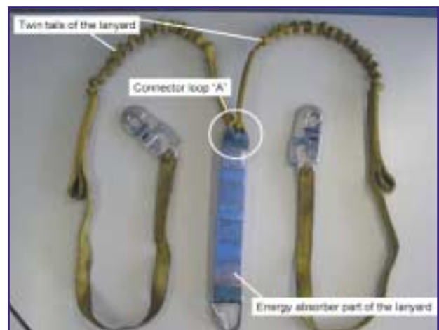
Figure 2: Failure of lanyard at loop "A"

From the lanyard used in the incident, it has been observed that the energy absorber on the lanyard did not operate but the webbing on the absorber's connector loop "A" failed (Refer to Figure 2). At this stage it is not possible to determine the cause of the incident. However, a number of findings are apparent from the preliminary investigations and the tests conducted on similar lanyards. An important finding that should be highlighted immediately is that failure of the lanyard may occur when one tail of the lanyard is attached to an anchorage point and the other tail is back-hooked in particular configurations to a side attachment D on the harness (Refer to Figure 3).