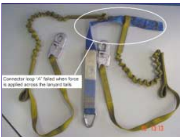
Figure 1: Twin tail fall arrest lanyard

The twin tail arrest lanyard is the term used to describe a fall arrest system where a worker uses the twin tails of the lanyard to hook on and off as he or she climbs a structure. In this method the climber is always connected to the structure via one of the tails as he or she climbs the structure. An example of a twin tail type lanyard can be seen in Figure 1.