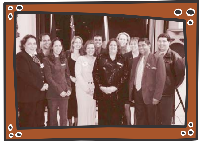
- The 2001 NAIDOC Committee at the Minister's Reception.