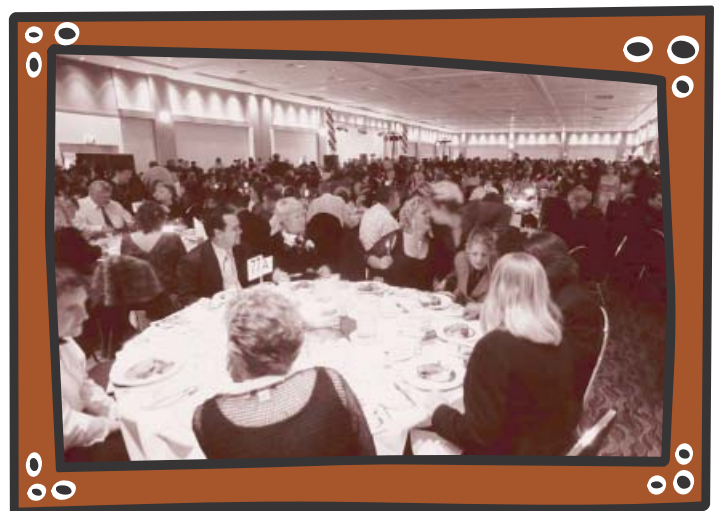
- All the fun of the Naidoc Ball.