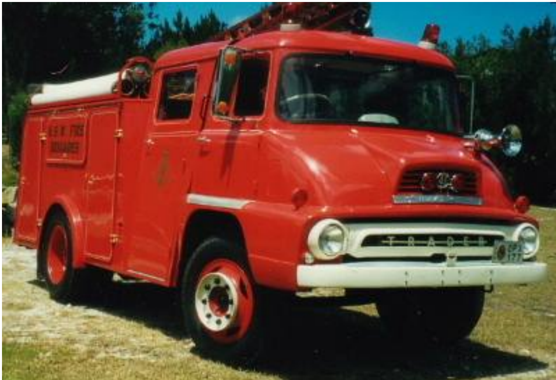
This is Doug Connolly's Thames Trader pumper ME32 (see article page 6)