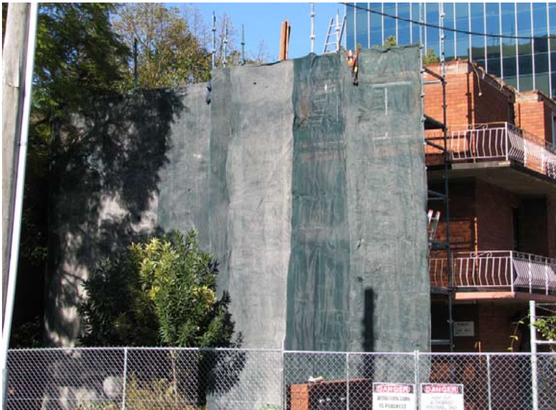
Demolition work being carried out recently to make way for a competition winning office building in the Parramatta CBD

To undertake demolition work in NSW, however, it is generally necessary to hold a licence and/or permit issued by WorkCover. For more information, refer to the WorkCover website ( www.workcover.nsw.gov.au ) or call WorkCover on 13 10 50.