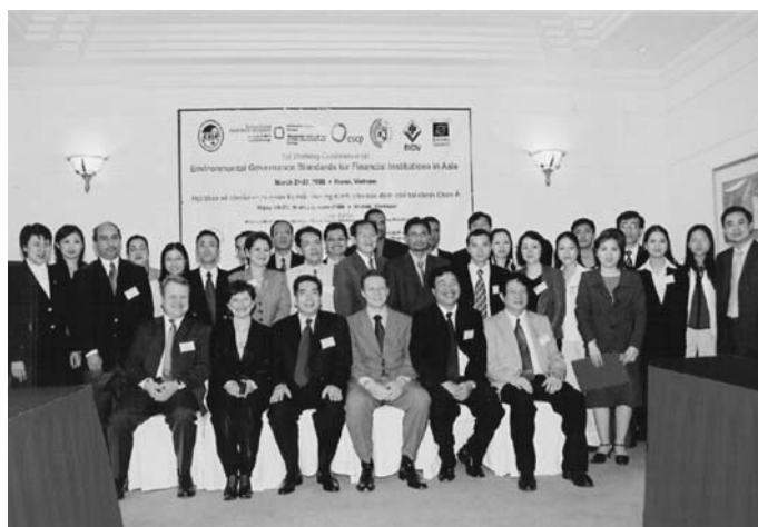
The 1st Working Conference on Environmental Governance Standards held on March 20-22, 2006 in Hanoi, Vietnam.

In July 2005, ADFIAP received a Euro 346,446 grant for its new initiative, Environmental Governance Standards for DFIs in Asia (EGS). The grant was provided by the European Commission through its EU-Asia Pro Eco Programme.