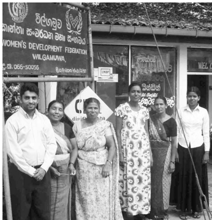
Project staff with members of the Wilgamuwa Women's Development Federation during a microfinance partner assessment activity.

activities, a critical constraint has been a lack of access to finance for investment purposes.