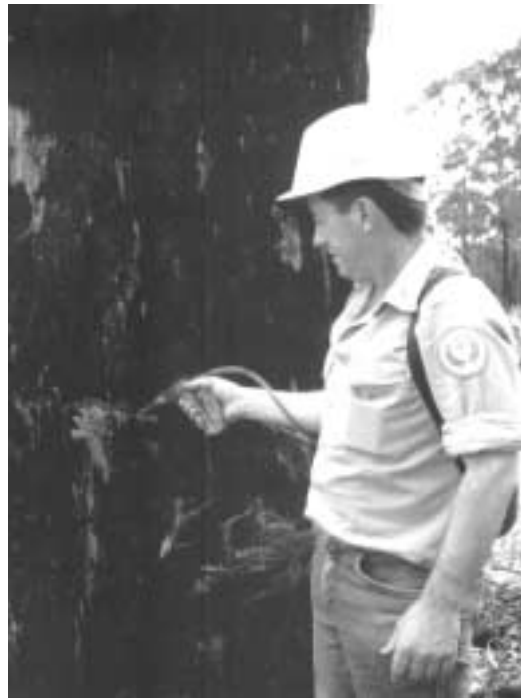
Figure 4 Stem injection by 'nick and squirt' using a 'spot gun' and a back-pack

In all methods, repeated cuts/drills, with centres 13 or 25 cm apart are made downwards at a 45 ° angle through the bark and partly into the sapwood, around the circumference of the tree. The chemical used is either glyphosate or a triclopyr/picloram mixture developed and registered particularly for tree control. See Section 8 for details on the suppliers and costs of the equipment and chemicals.