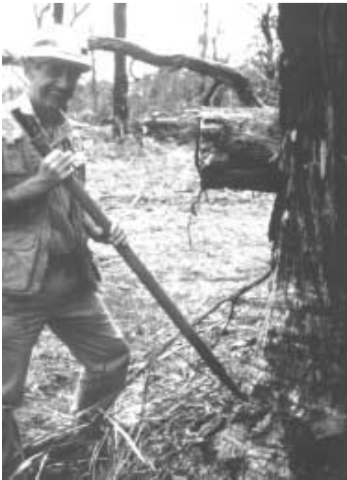
Figure 3 Stem injection with basal spear

The use of a petrol-engine driven power drill, instead of an axe, will allow for easier and more thorough penetration of thick-barked species and will create a large enough reservoir to hold the required dose of herbicide.