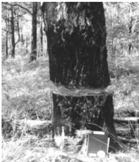
Figure 5. Overwood treatment by sap-ringing – Heywood