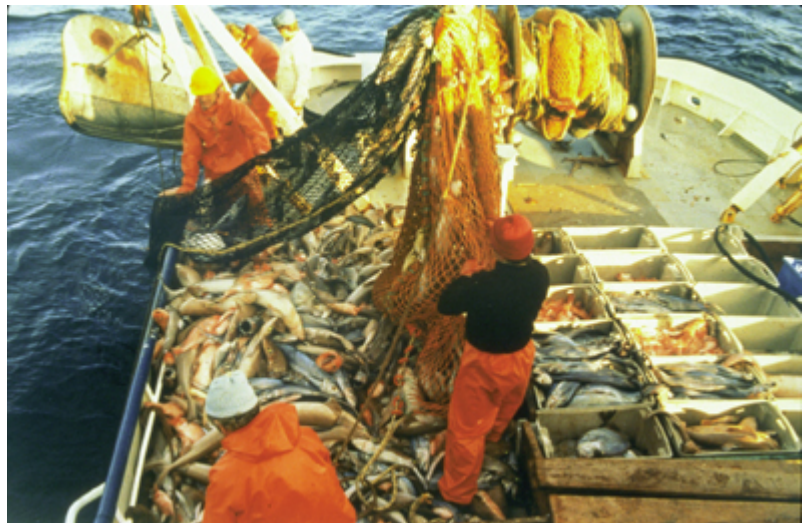
Unloading a catch

“The tender provides an opportunity for those wishing to leave the industry to do so, while also improving the profitability of those who remain. This is the largest structural adjustment of this kind for fishers. I strongly urge you to consider this request for tender carefully”.