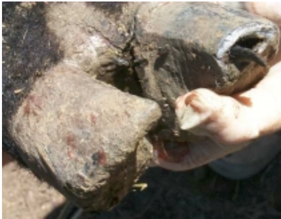
Figure 3: The upper claw is infected. The tip of the claw has been cut showing underrunning of the sole. Separation of the hoof wall can be seen at the coronary band on the edge of the interdigital space.