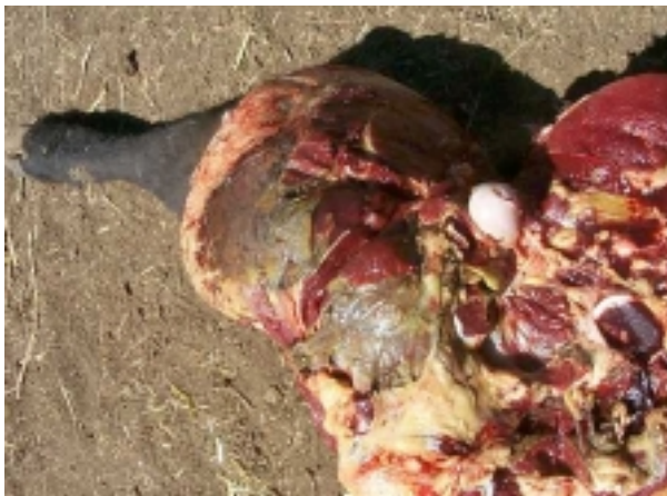
Figure 4: The dirty green tissues are where infection has tracked up the leg from an infected foot, into the rump muscles permanently disabling the animal.

It is advisable to have lame cattle examined by a veterinarian. Early treatment to drain infection from beneath the sole, remove weight bearing pressure from damaged claws using wooden blocks, and to administer antibiotics and pain killers, may prevent the cattle becoming permanently lame or “downers” and prevent the purchaser incurring a significant economic loss.