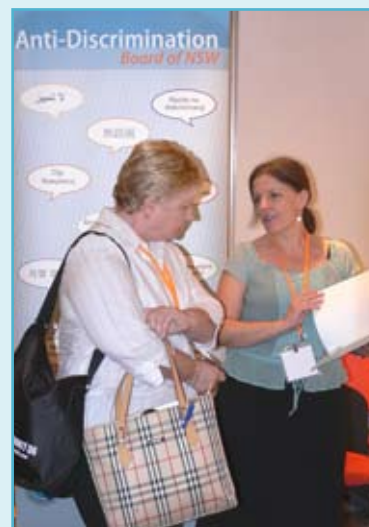
Staff from the ADB Workplace Education Team recently attended the 2006 HR Summit at the Sydney Hilton.

For more information on Carer's Responsibilities please go to our website at: http://www.lawlink.nsw.gov.au/lawlink/adb/ll_adb.nsf/pages/adb_carers_responsibilities