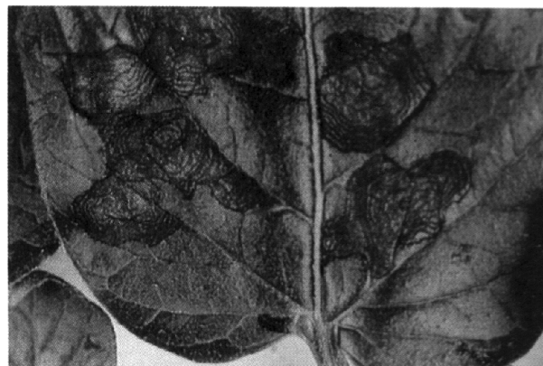
Figure 2. The concentric rings of target spot