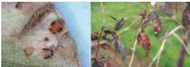
Figure 4. Nymphs and characteristic foliage damage of Psyllids

Psyllids pose a significant ongoing threat to E. camaldulensis , especially to foliage in the lower crowns although upper crowns may also be affected in severe infestations.