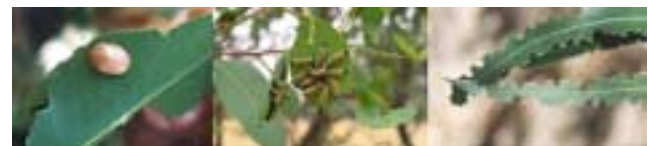
Figure 1. Adult beetle, larvae and characteristic foliage damage of Chrysomelid leaf beetles.

Chrysomelid leaf beetles potentially pose a significant threat to eucalypts, particularly in stands of E. globulus aged 8+ years, where they can cause significant defoliation predominantly in the upper crown.