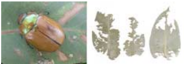
Figure 3. Adult beetle and characteristic foliage damage of Christmas beetles

Christmas beetles present a low to moderate threat, particularly to E. camaldulensis and to a lesser extent E. globulus on ex-pasture sites within widely spaced trees.