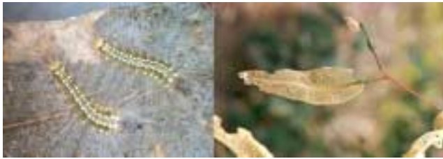
Figure 2. Larvae and characteristic foliage damage of Gum leaf skeletoniser

The Gum leaf skeletoniser also has the potential to cause significant damage to E. camaldulensis in the Wimmera region across all ages.