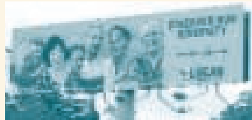
Billboard campaign spotlights diversity

Favourable feedback was received on Logan City Council's Celebration of Diversity campaign. It is noted, however, that such efforts are normally driven by government funding or by socially aware community groups. It is seen as necessary to promote the adoption of such strategies by a broader range of institutions and organisations, including the private sector.