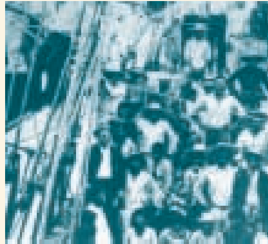
neg. no. 18058

As an outcome of a government forum held in Mackay in February 2000 on Australian South Sea Islander issues, a Mackay-based taskforce was formed to develop an action plan to address issues relating to delivery of government services to members of the community in the Mackay region.