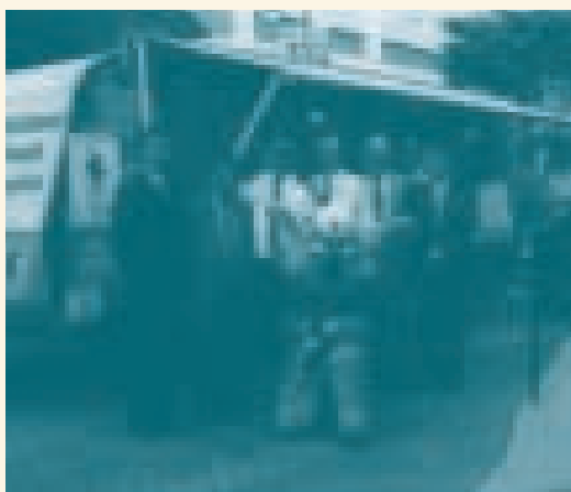
Launch of the Queensland Fire and Rescue Authority's community safety van in Fortitude Valley, Chinese New Year 2000