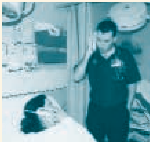
Interpreting services via cordless dual handset telephones at the PA Hospital.

The project also resulted in improved opportunities for professional development and training. Medical interns now receive training on cultural diversity in the health care environment and the Interpreting and Multicultural Manual has been distributed to all units and departments of the hospital.