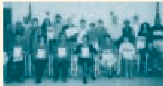
The Learning Circle participants

MAQ fully supports the reconciliation process and is represented on the State Reconciliation Council (now called Reconciliation Queensland Inc.) and funds the position of a Multicultural Reconciliation Project Worker. The role of the worker is to actively engage ethnic communities in the reconciliation process. The worker was involved in cultural exchanges between ethnic and Aboriginal communities; speaking with ethnic communities throughout the state and building relationships with ethnic schools. The worker also conducted a Learning Circle seminar, focusing on Aboriginal and Torres Strait Islander history, culture, heritage and issues underlying the reconciliation process.