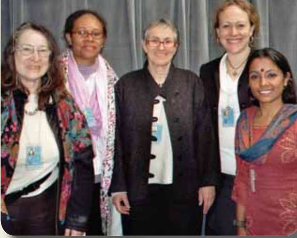
SCMer's Diary, from p. 21

Bangladesh to the forum. I could see the global solidarity in the forum which made me feel empowered while speaking about the women in Bangladesh. My country is far from achieving our goal and it is a challenge to keep this movement going. The faith based groups have a greater responsibility to restore violence free society, hence it is important to address the issue of gender equity within the Church as a faith based organization. The church ought to be the model for society through its wholistic approach for God's creation and the youth and student movements like SCMs should act an agent to promote gender justice.